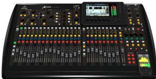
Soundcraft Spirit Live 4 2 channels - 24 channels