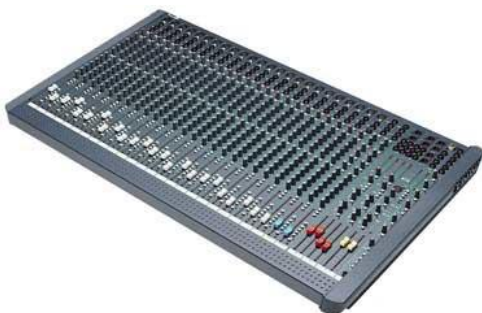
Soundcraft Spirit Live 4 2 channels - 24 channels