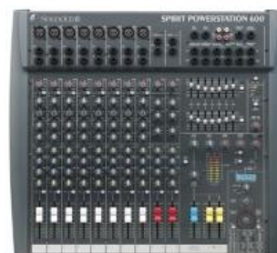
Soundcraft Spirit POWER STATION 600